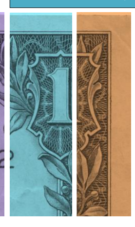
EM's FY 2016 Budget Request - $5.818 Billion Total